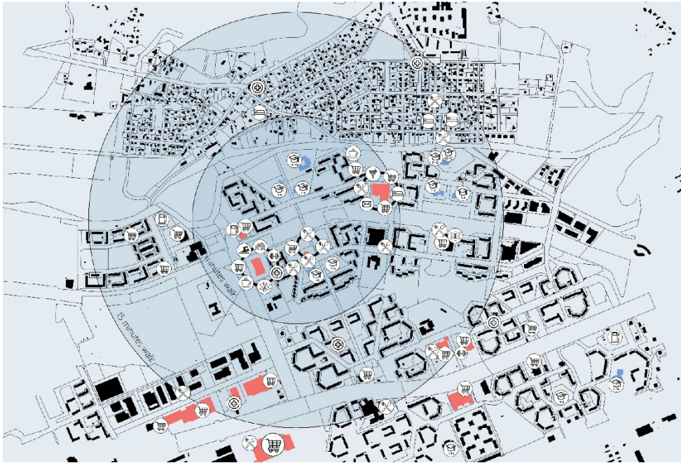
15 minute city

Kuristiku already meets many 15-minute city criteria, but some green areas remain underused and social spaces are lacking. The proposal introduces S, M, and L infills to activate public areas: S for small-scale interventions like kiosks or pavilions, M for medium functions like offices or bars, and L for a large cultural center. Surface parking would be moved to decentralized garages, freeing space for greenery and play areas. A new bike line would connect Kuristiku to Lasnamäe and potentially the city center, enhancing mobility. Together, these measures aim to complete Kuristiku's transformation into a fully functioning 15-minute city.